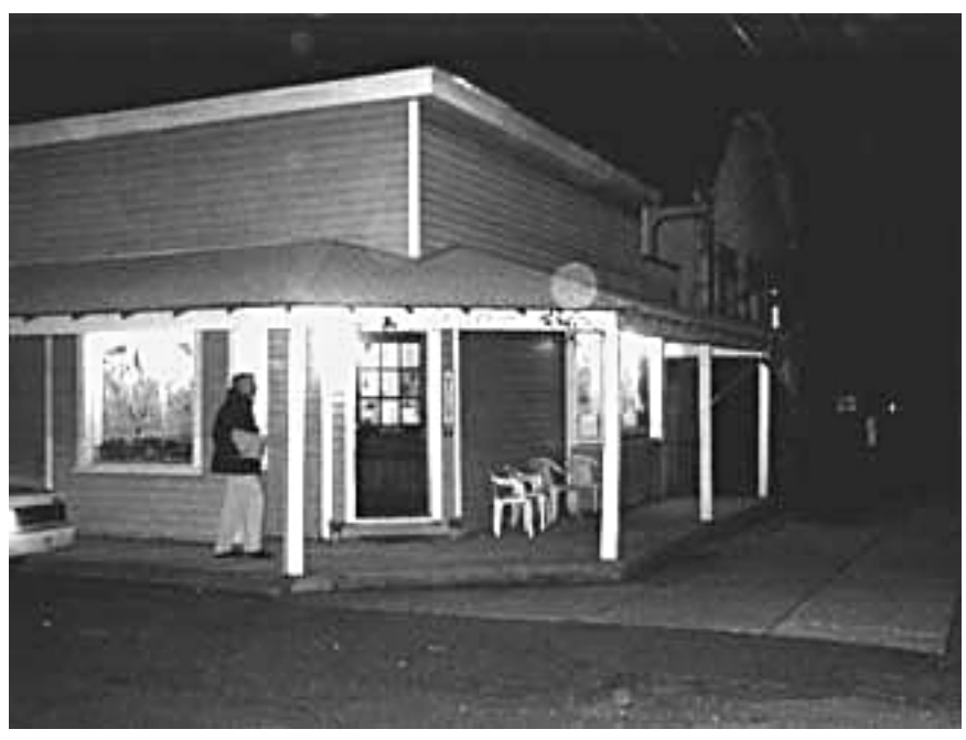
Mariposa's "Center for Artistic Expression" in Berwyn lights up at night.