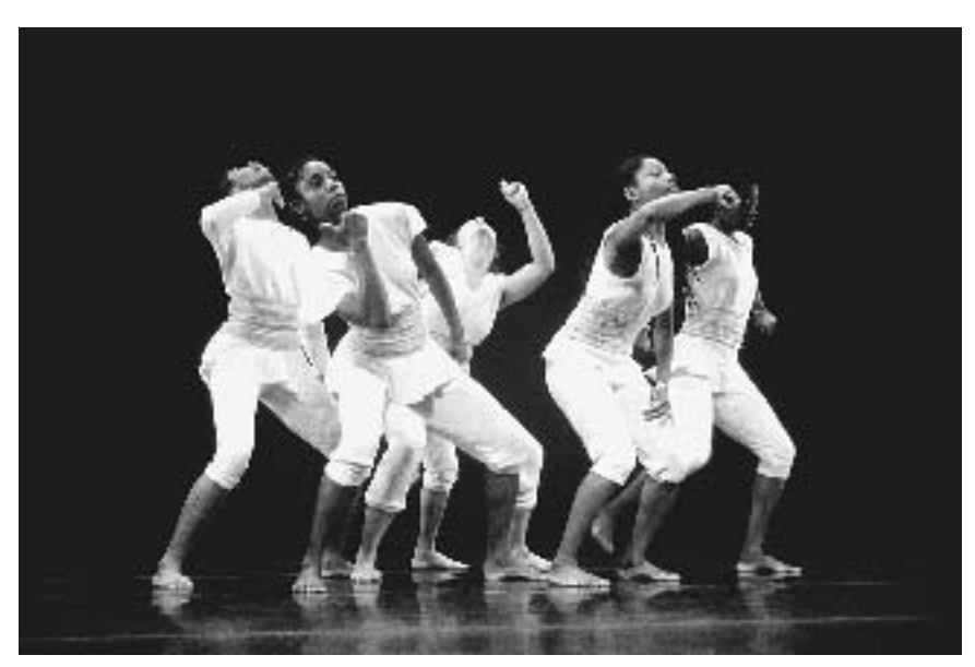
An African-American dance group performing at the Publick Playhouse, one of M-NCPPC's comprehensive art facilities. (See page 98.)

The Maryland-National Capital Park and Planning Commission, Department of Parks and Recreation, is the primary arts presenter in Prince George's County. The department coordinates and manages three comprehensive art facilities: Montpelier Cultural Arts Center (Laurel), Prince George's Publick Playhouse (Cheverly), and Harmony Hall Regional Center (Fort Washington). Although many art programs are based at these facilities, numerous outreach arts services and programs are offered at other venues throughout the county. These include day camps; art classes; touring exhibitions; performances in music, dance and