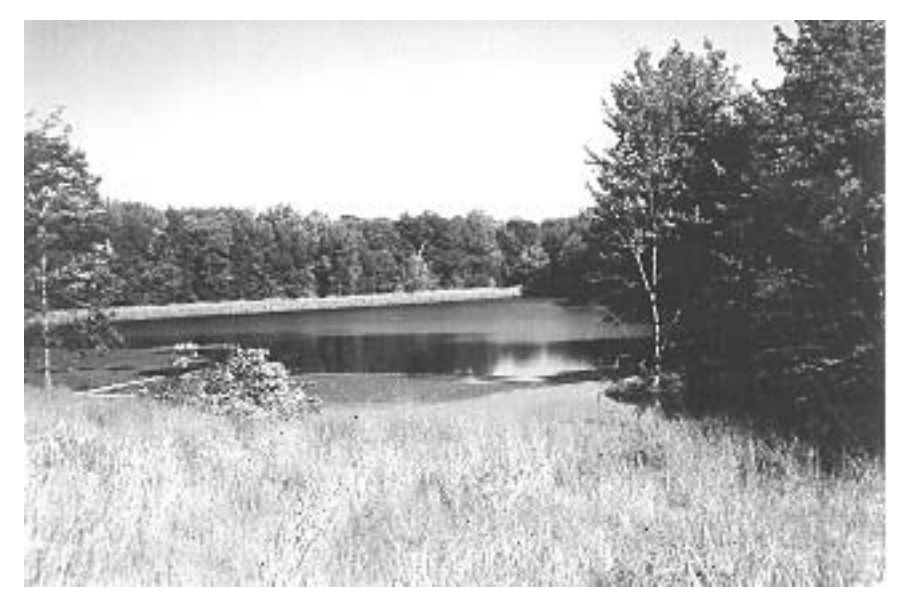
Snowden Pond is one of the environmental treasures of the Patuxent Research Refuge.

To minimize unnecessary destruction of woodlands and specimen trees, the Prince George's County Woodland Conservation and Tree Preservation Ordinance was enacted in 1990 and is part of the County Code. This regulation requires a negotiated tree conservation plan that sets site-specific conservation requirements and commits the applicant to the use of certain tree protection techniques before, during and after construction. Strict penalties are imposed up to $1.50 per square foot of disturbed area if the plan is violated.