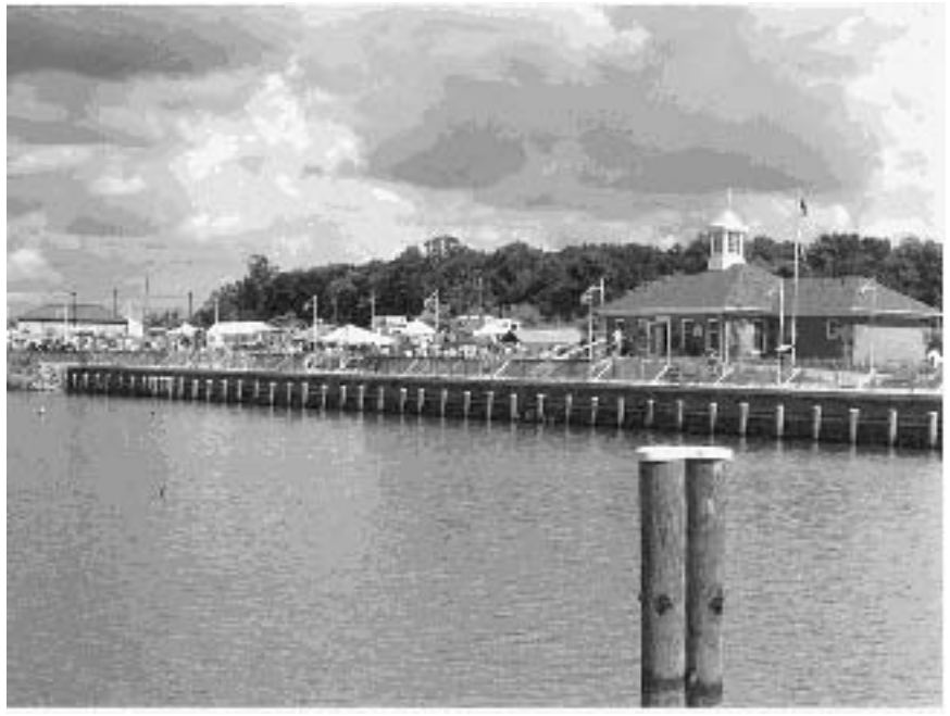
The new facilities at the Bladensburg Waterfront Park offer visitors not only recreational opportunities, but information on the history and ecology of the Anacostia River.

The Department of Parks and Recreation of M-NCPPC has completed the first phase of restoration of the former Bladensburg Marina, now known as the Bladensburg Waterfront Park. The purpose of the park is