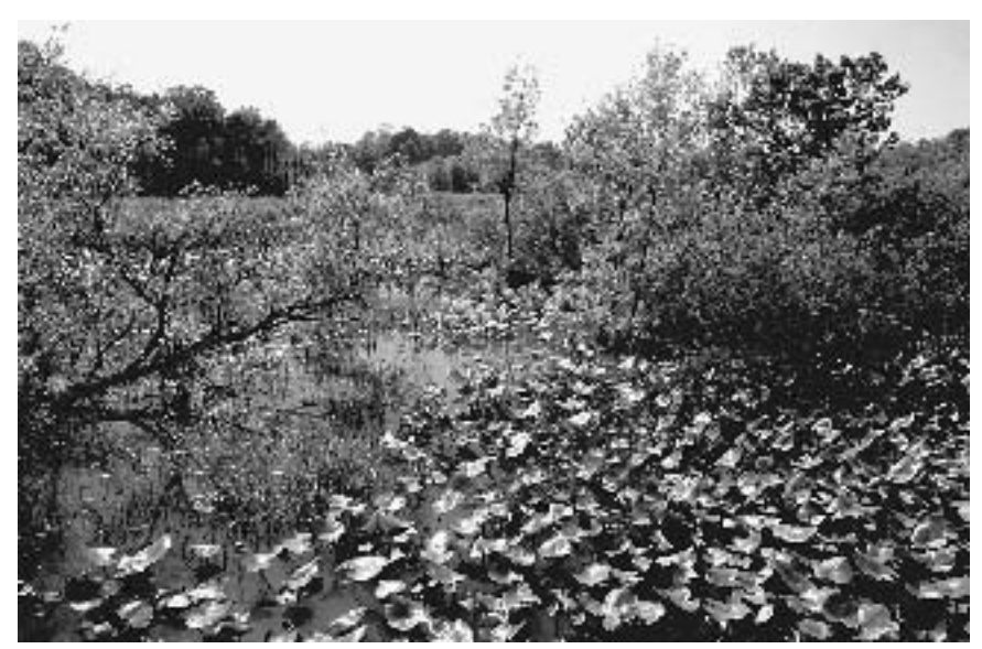
One of many ecologically-sensitive wetlands in the Anacostia Trails Heritage Area.

Prince George's County, through its Department of Environmental Resources (DER), and M-NCPPC, in cooperation with the Maryland Department of the Environment, have spent $6 million in the watershed since 1992, toward a goal of implementing 100 water quality and wetland restoration programs to help restore the river. A dedicated fund through a special taxing district for all of Prince George's County to provide stormwater management is slated to provide as much as $12 million