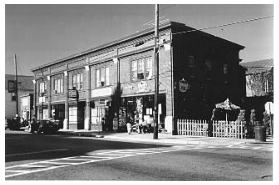
Downtown Mount Rainier exhibits interesting early commercial architecture, such as this five-part 1920s commercial/residential building on 34th Street.

For the stretch of US 1 from College Park to Mount Rainier, a partnership among several communities (Mount Rainier, Brentwood, North Brentwood, Hyattsville, Riverdale Park, University Park and College Park) has existed for some time to address these issues, largely through