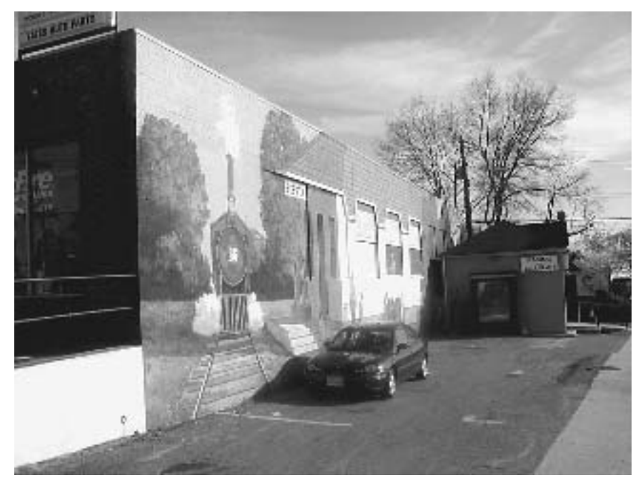
This mural was recently painted on a commercial facade on US 1 in Berwyn, celebrating the railroad history of this community.