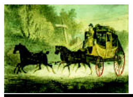
Chapter Five A Strategy for Stewardship