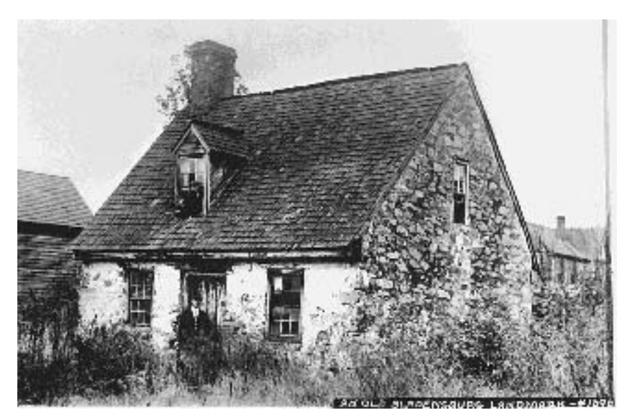
The Market Master's House, a mid-18th-century dwelling built for the manager of the adjoining market space, was in deteriorating condition at the beginning of the 20th century.